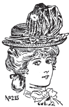
No. 215. Misses' straw hats, tan crown, trimmed two shades taffeta silk, and ornament, fold of velvet under brim, special..... $2.55