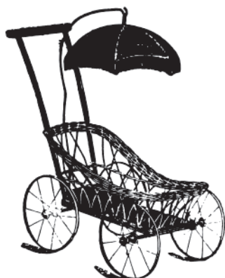
M9 — Better constructed carriages; parasol, lined, etc. $3.00, $3.25, $3.75, $4.00