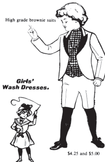
High grade brownie suits

We accept VISA, Mastercard, American Express, Diners, Discover or Direct Debit. Fair exchange on American dollar.