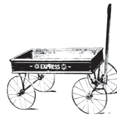
T6 — Wood box wagons ..... $2.75, $3.50