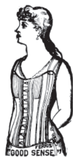
233. Misses' hygiene waist GOOD SENSE™ $1.00